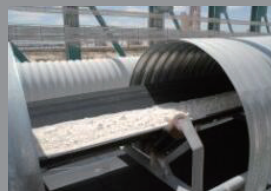
White Cement plant in Sinai, Egypt