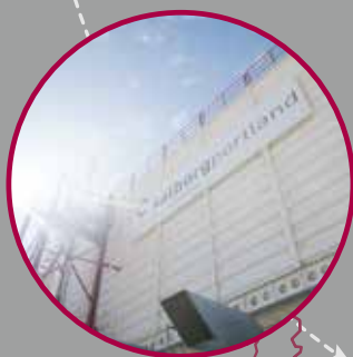
Terminal & Warehousing