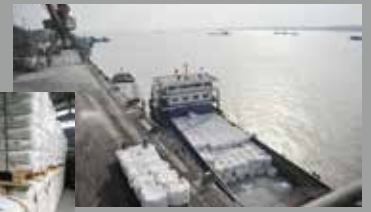
Anqing Port along the Yangtze River