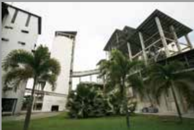
White Cement plant in Ipoh, Malaysia