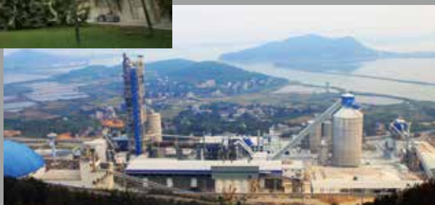
White Cement plant in Anqing of Anhui, China