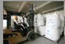
Warehouse in Ipoh, Malaysia Plant