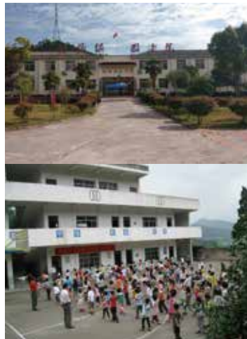
► Financial aid to low income students

Cementir's Anqing plant is commitment to community care and social responsibility. Anqing plant sponsored its nearby beautiful village construction project, actively joined in "honor the aged" social activities and sponsored the low income students for more than 10 years.