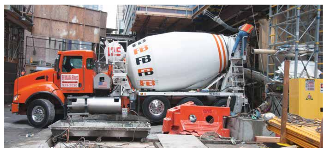
The requirements for the concrete mixes are challenging. Ferrara Brothers deliver pumpable SCC mixes that will eventually be pumped 1,300 feet straight up. Photos by Joe Nasvik

R&S uses PERI's hand-set "drophead" floor forming system, allows workers to safely set them in place from below. Photos by Joe Nasvik