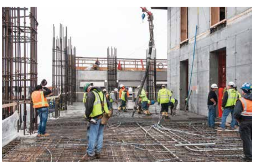
With the core structure on the right and the exterior columns and spandrels on the left of the photo, the 10" thick "flat plate" floors act as a diaphragm, joining the two vertical elements together.

DOKA's self-climbing rollback system is also being used on this project. The five-floor level climbing system surrounds the perimeter of the building to provide workers with multiple levels of wide, safe work decks for setting and stripping forms, removing anchors, patching the architectural exterior surfaces,